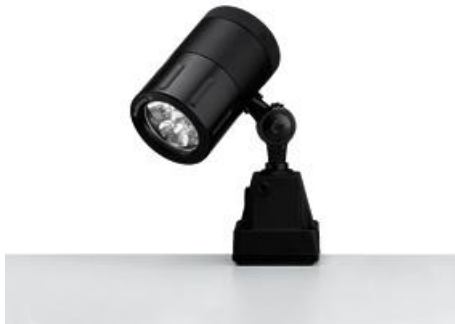
SPOT LED 003 - MCXFL 3 S

fitted with work equipment connected load power consumption system of protection class of protection