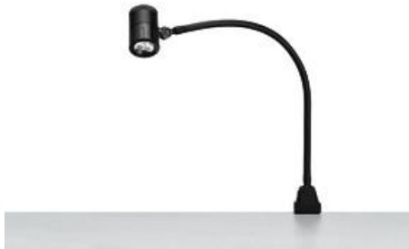
SPOT LED 003 - MCTFL 3 S

fitted with work equipment connected load power consumption system of protection class of protection