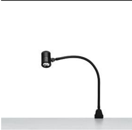
SPOT LED 003 - MCTFL 3 S