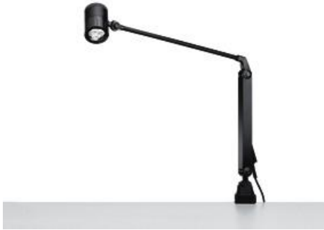
SPOT LED 003 - MCBFL 3 S