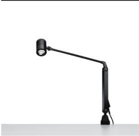
SPOT LED 003 - MCBFL 3 N