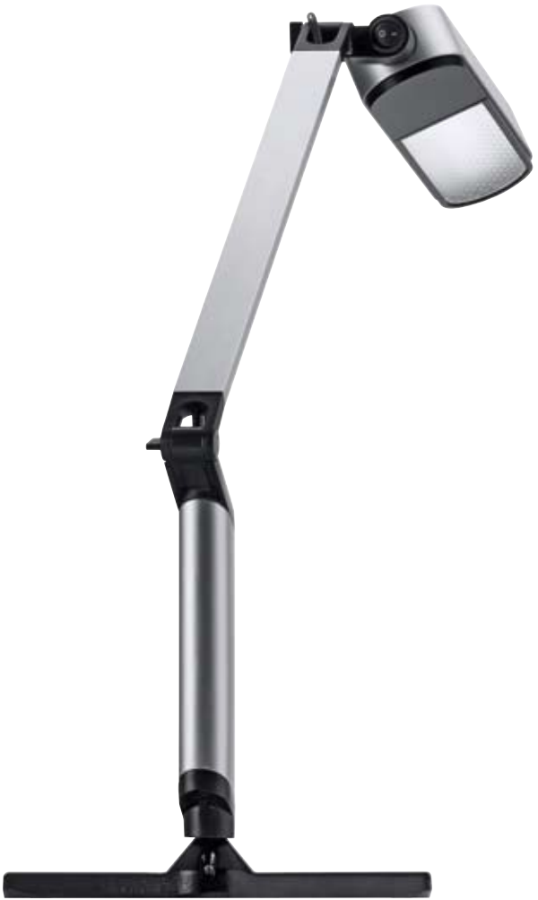
MAIA, MINELA | Task luminaires Design: Weinberg & Ruf